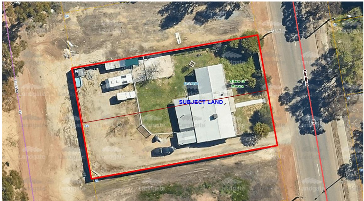
Location & Lot Configuration Plan

The applicant is seeking Council's development approval to construct a new 96m 2 outbuilding (i.e. shed) and 72m 2 carport (i.e. awning) on Lot 14 (No.30) Gardiner Street, Moora for domestic storage purposes and private vehicle parking with all access via the adjoining Lot 15 located immediately south.