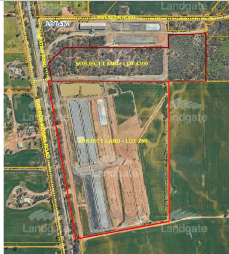
Location & Lot Configuration Plan

Lot 4300, which comprises a total area of approximately 13.69 hectares, is characterised by large stands of partially disturbed native vegetation across the majority portion of the land, the regional environmental significance of which is not known and hasn't been confirmed in the development application received from CBH. Despite the presence of a significant amount of native vegetation, Lot 250 forms an integral part of CBH's existing operations and contains sealed and drained vehicle access ways including truck marshalling area and an existing heavy vehicle weighbridge, all of which have been developed along the land's eastern and southern boundaries.