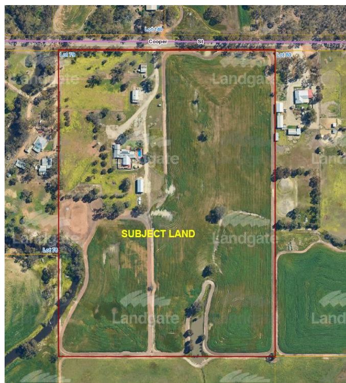
Location & Lot Configuration Plan

Lot 79 comprises a total area of approximately 10.964 hectares and is generally flat throughout with the natural ground level being approximately 200 metres AHD including the location where the sea container is proposed to be sited. The subject land has been extensively cleared with a few small stands of remnant vegetation remaining throughout. The land is also characterised by two (2) small creek lines in its southern half.