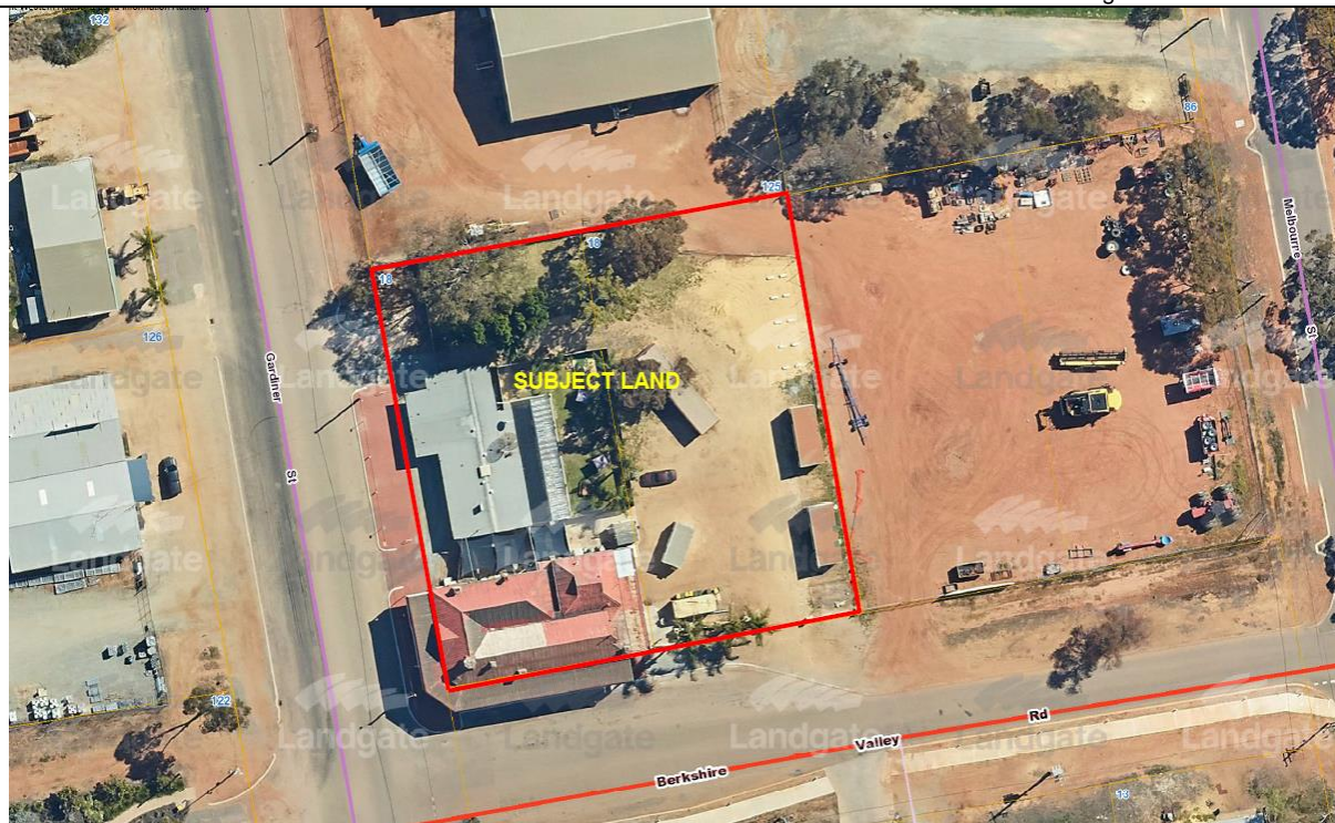
Location & Lot Configuration Plan

The land has been extensively cleared and developed for commercial purposes (i.e. the Junction Hotel) and contains a number of associated improvements including buildings, vehicle accessways, informal parking areas and landscaping. The land is also served by a wide range of key essential service infrastructure including power, water, reticulated sewerage, telecommunications and stormwater drainage.