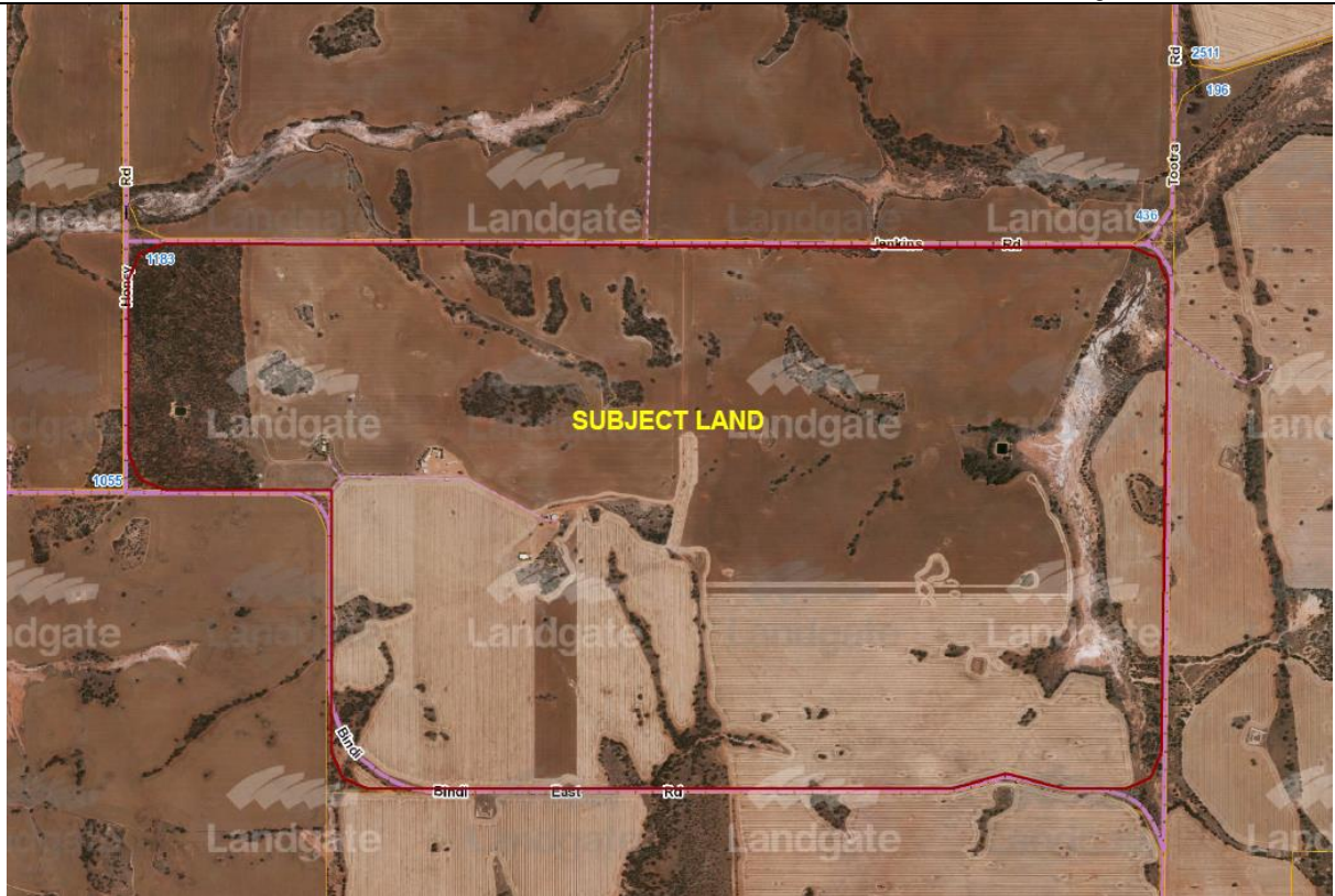
Location & Lot Configuration Plan

The subject land is gently sloping throughout with the natural ground level being approximately 310 metres AHD. It is largely cleared for broadacre cropping and grazing with scattered areas of native vegetation, the largest stand being approximately 45 hectares along the land's western boundary. There is no evidence to suggest the land is subject to any inundation or flooding.