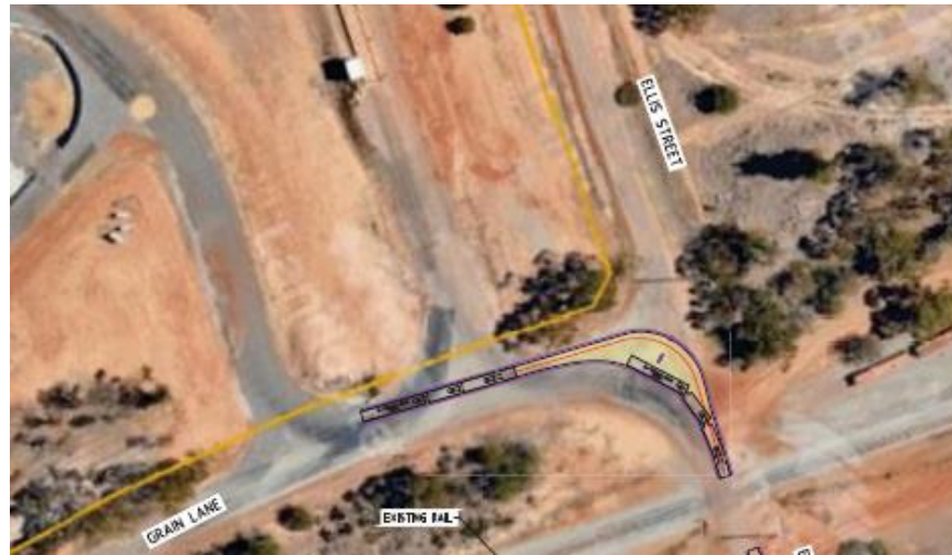
Swept Path Analysis Plan