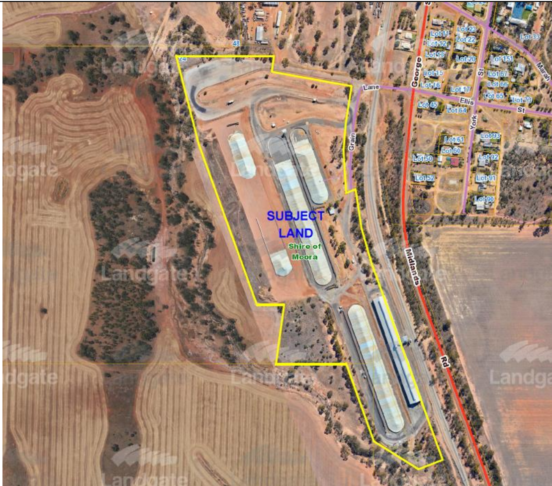
Location & Lot Configuration Plan