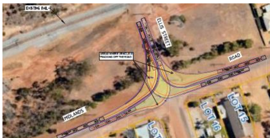
Swept Path Analysis Plan