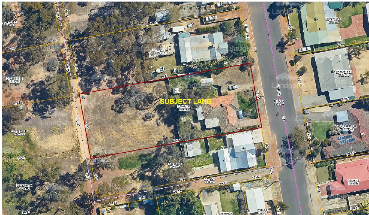
Location & Lot Configuration Plan

as well as a 17.6m 2 domestic storage shed / garage, landscaping and concrete driveway. The balance portion of the land to the west remains vacant / undeveloped.